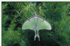
ONE OF OUR NEIGHBORS