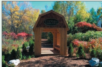
COVERED BRIDGE (walk to park & town)