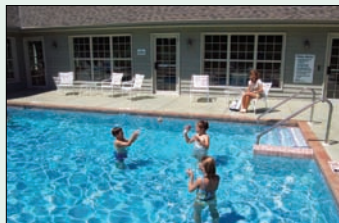
OUTDOOR POOL & SUN DECK