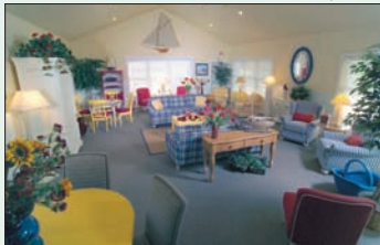
LOUNGE (with adjoining prep kitchen)